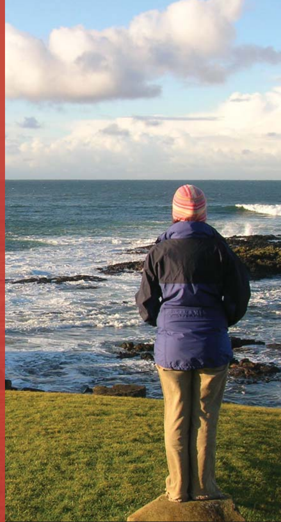
retiree health benefits